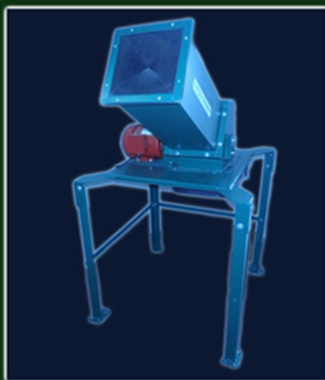
Shown above with optional stand